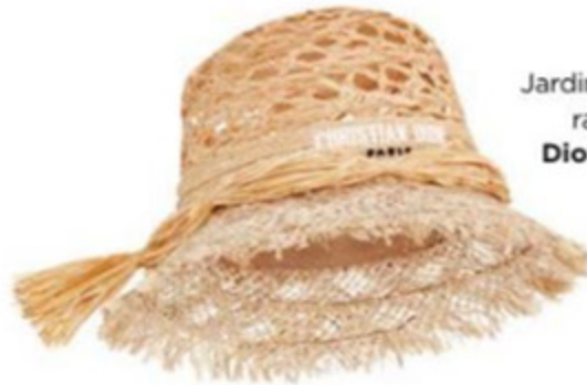
Jardin patchwork raffia hat, Dior; dior.com

These chic essentials have you covered from head to toe for having fun in the sun