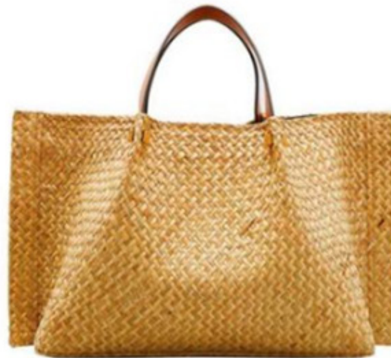
VLogo raffia tote bag, Valentino Garavani; bergdorfgoodman.com