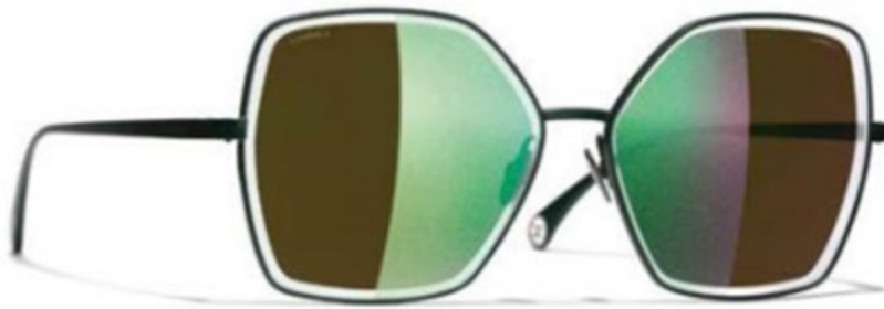
Butterfly sunglasses, Chanel; chanel.com