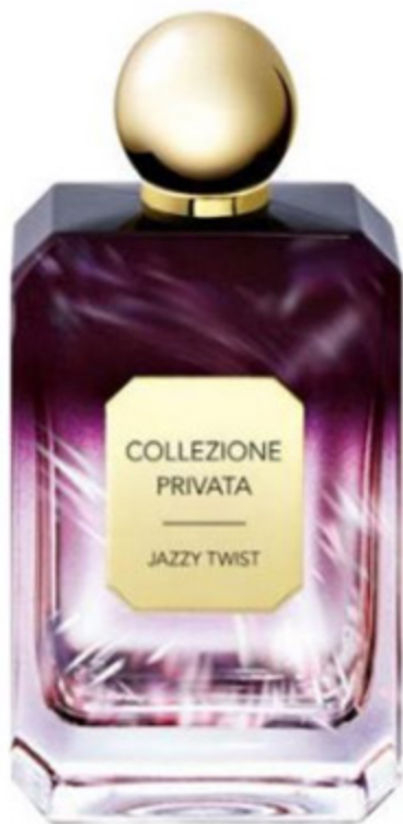
Collezione Privata Jazy Twist eau de parfum, La Maison Valmont; lamaisonvalmont.com