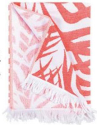
Zebra Palm beach towel, Matouk; matouk.com